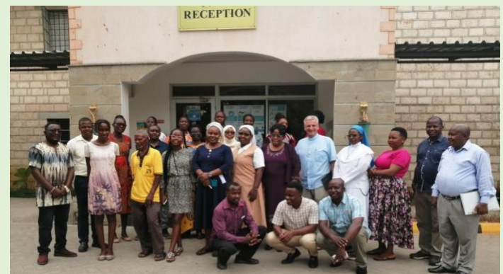
2022 Hilton Project Programme

Through the generous support from Talitha Kum International , RAHT conducted a training in May 2021 for first responders in Mombasa County. In February 2022, an assessment was conducted which entailed verification of the team’s understanding of human trafficking and ability of the team in handling cases related to human trafficking. 23 participants took part in the follow up process. The group demonstrated their abilities and skills which will be able to help them advocate and stand against vices promoting human trafficking in Mombasa.